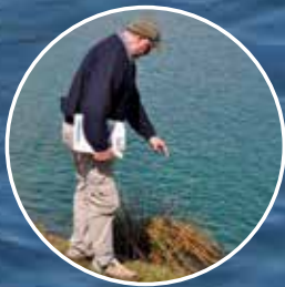
Lake Study Consultation