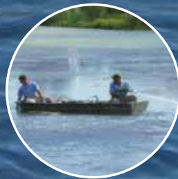
Algae and Aquatic Weed Control