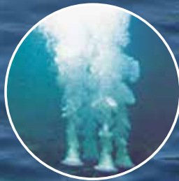
Lake Aeration Installation & Maintenance