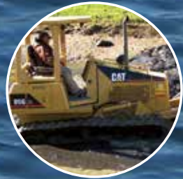
New Lake Design, and Construction