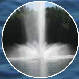
Fountain Installation and Repair