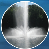
Fountain Installation and Repair