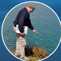
Lake Study Consultation