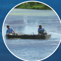
Algae and Aquatic Weed Control